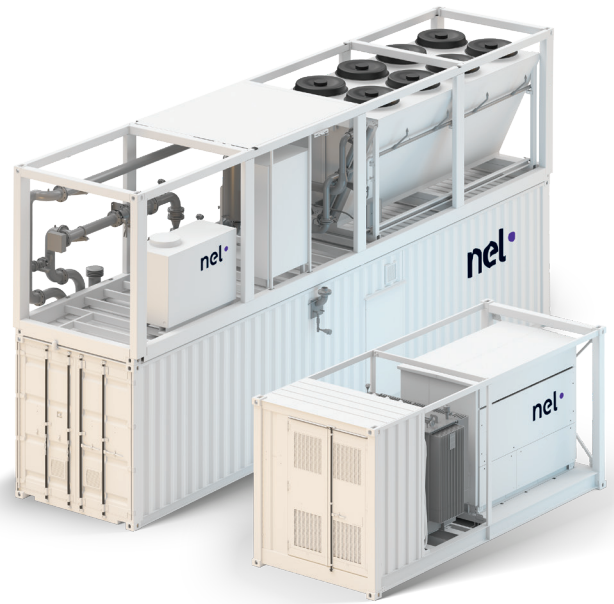
Power Supply Enclosure, Electrolyser Enclosure and optional Thermal Control System – installation may vary.